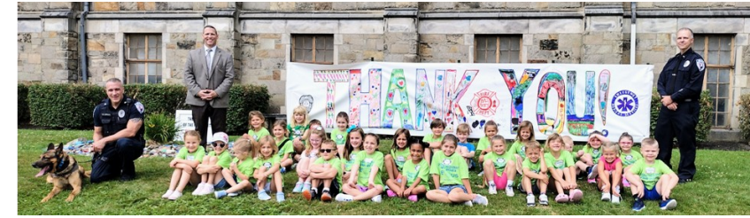
Our VBS heroes had a visit from community super-heroes.