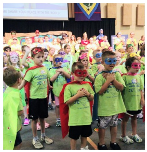
sang songs and danced,