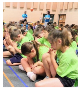
and prayed together