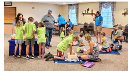
Hands-Only CPR was taught to VBS kids