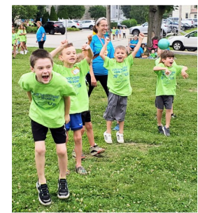
They played and laughed