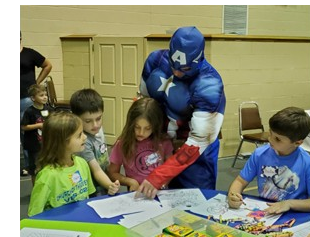
Captain America & Friends

On July 9th, over 125 guests and 40+ VBS volunteers had a SUPER fun time at VBS Preview Day! Everyone enjoyed themed snacks and games, a coloring station, and creating a special banner for our local first responder superheroes. VBS kids met group leaders and volunteers, and new friends to prepare for the exciting week ahead! RJM Safety Resources, LLC showed us how all ages can be superheroes with hands-only CPR demonstrations. It was a great way to show our VBS families a warm Covenant welcome before the start of VBS the following week.